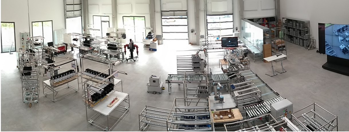
Figure 3: Target-optimized work system solution at Werk150