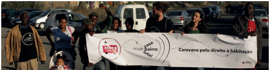
Fig. 2. The Caravan for the Right to Housing, September 2018. Source: https://caravanapelahabitacao.wordpress.com/ .

First, the acknowledgement of the variety of struggles, both those with a longer history and those pushed by recent trends (see above), has inspired attempts at creating networks of solidarity and struggle among different actors. The Caravan for the Right to Housing (Caravana pelo Direito à Habitação; https://caravanapelahabitacao.wordpress.com/ ) is the most important example (see FALANGA et al. forthcoming). The Caravan, which travelled throughout Portugal in September 2017, was launched with the goal of giving visibility to housing struggles around the country, and shaping housing as a common field of struggle for populations as different as Afro-descendants living in self-built settlements and middle classes being pushed away from urban centres (see Fig. 2).