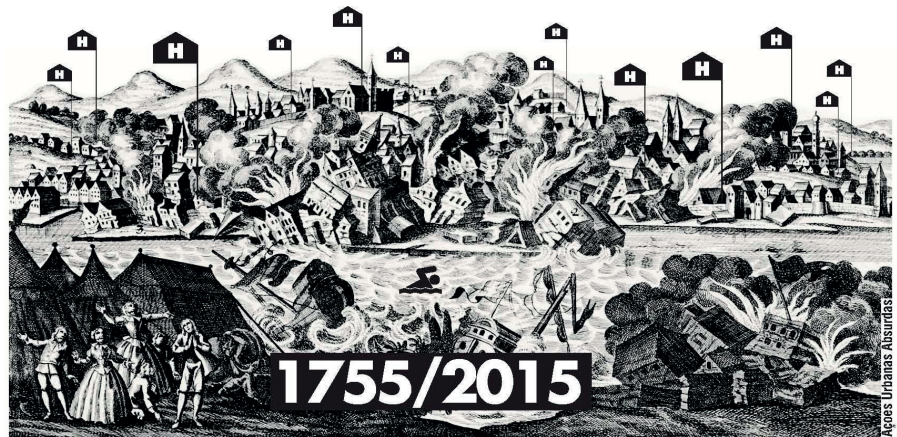
Fig. 3. Project Terramotourism, by Left Hand Rotation. See: www.lefthandrotation.com/terramotourism/ .

IN "BRAND CITIES": TOURISM TSUNAMI AND GENTRIFICATION ALERT