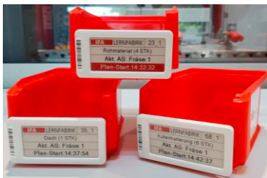
Fig. 3. Loading boxes with ESLs at front and back and RFID cards at both sides.

To support order execution on the shop floor, a system using ESL (electronic shelf labels) was developed [16]. Various data from the PPC system is brought to the shop floor via the ESL almost in real-time. The information provision is customized for each addressee and considers the progress of production. The digital order execution support system makes paper in production obsolete. The information provided is both static (e.g. order number) and dynamic (e.g. actual workstation). The concept helps to realize classic production control procedures (looking at the task sequencing e. g. FIFO or EDD) and, beyond that, enables the implementation of dynamic control procedures that aim on real-time optimization of logistical target achievement and use algorithms for this purpose (e. g. dynamic sequencing or dynamic routing). [16]