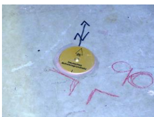
Figure 2: The point mark at floor level provided by BKG in 2017