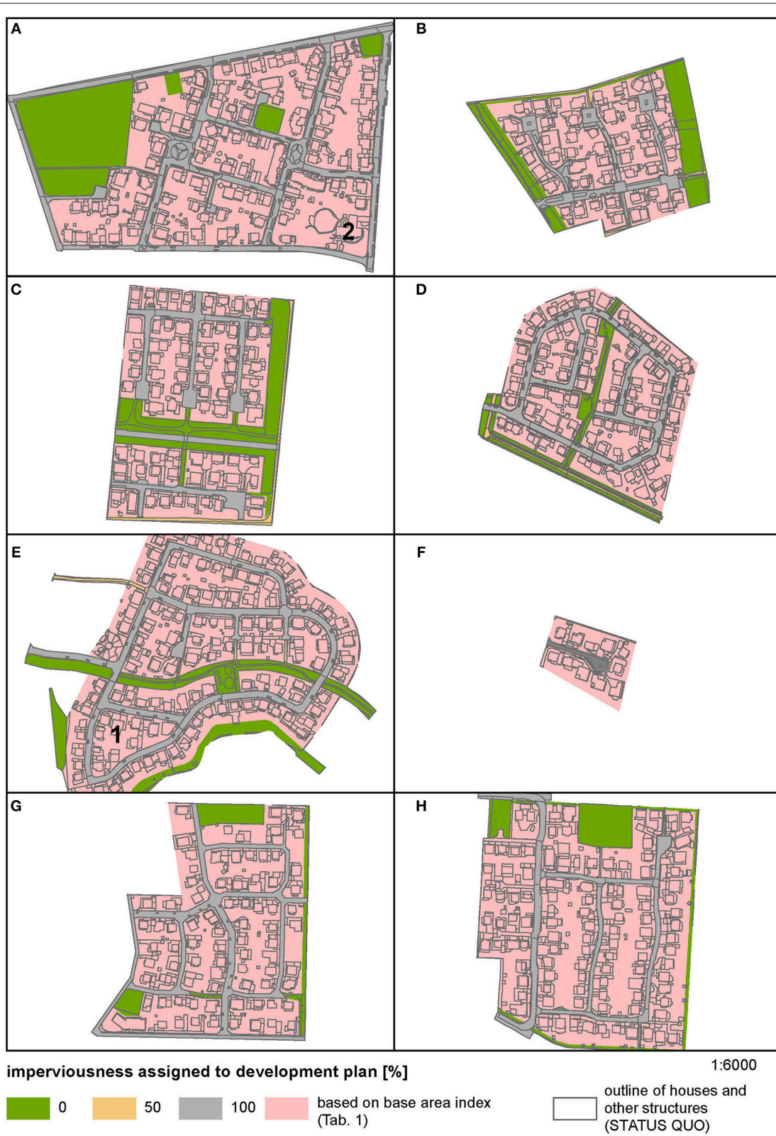
FIGURE 2 | The housing development plans with the assigned imperviousness. The status quo of built structures (houses, garages, driveways) are shown as light gray lines. For more information on the sites, refer to Table 1 . The number 1 in development plan E refers to a section with higher base area (c.f. Table 1 ). Number 2 in the development plan A refers to an area of public use where no base area was given. Therefore, the base area was assumed to be equal to the rest of the area.