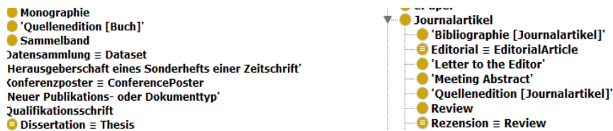
Fig. 3: Publication-related classes in the first version of the kdsf-vivo-alignment.owl

Fig. 3 illustrates the equivalences and subsumptions stated between the classes of the VIVO ontology and KDSF. As shown in Fig. 3, we have omitted the KDSF intermediate categories kdsf:Publikationstyp (English: “publication type”) and kdsf:Dokumenttyp (English: “document type”), since the categorization of publications in VIVO is already done by assigning categories to the types of documents without differentiation of form and content. Classes with a partial correspondence were inserted as sub-classes.