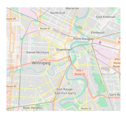
Fig. 3. Exemplary snapshot of the Winnipeg road network (OpenStreetMaps, 2017)

The exemplary instance is based on the road network of Winnipeg, Canada (INRO, 1999). As illustrated in Figure 3, Winnipeg has a mono-centric structure with a central core downtown and several adjacent districts. The traffic network includes several arterial roads as well as a dense structure of smaller roads. This allows us to consider several alternative paths between two specific origin and destination locations.