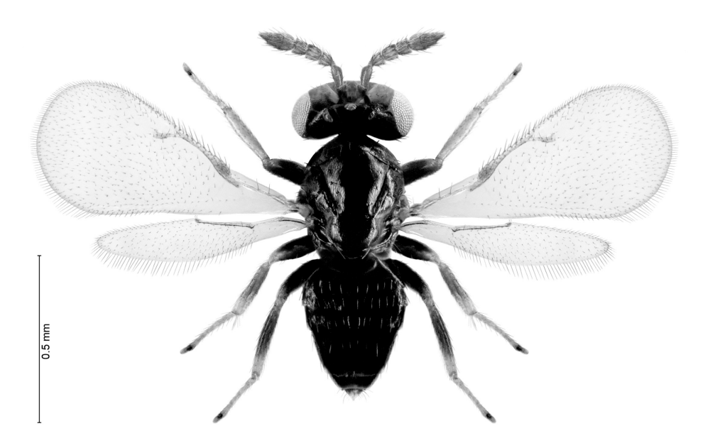
Fig. 3. Female Phymastichus coffea.