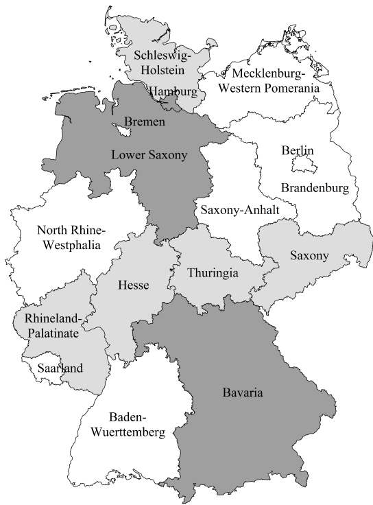
(a) Treatment Group 1