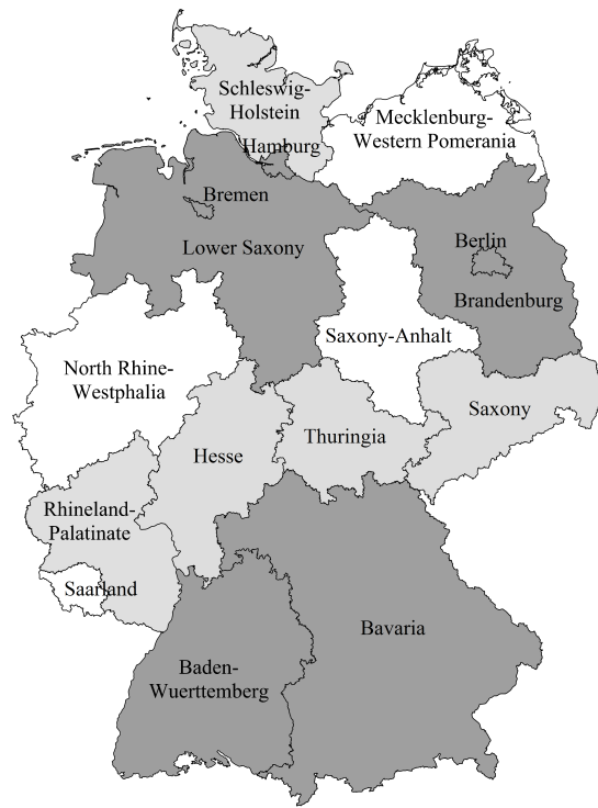
(b) Treatment Group 2