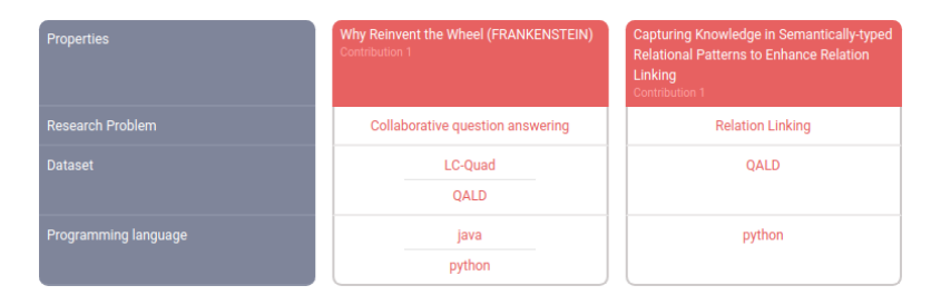
Fig. 3. ORKG UI state-of-the-art comparison for research contributions, showing a subset of shared properties between two articles.

Such features will underscore the possibilities enabled by machine actionable scholarly knowledge and corresponding infrastructure.