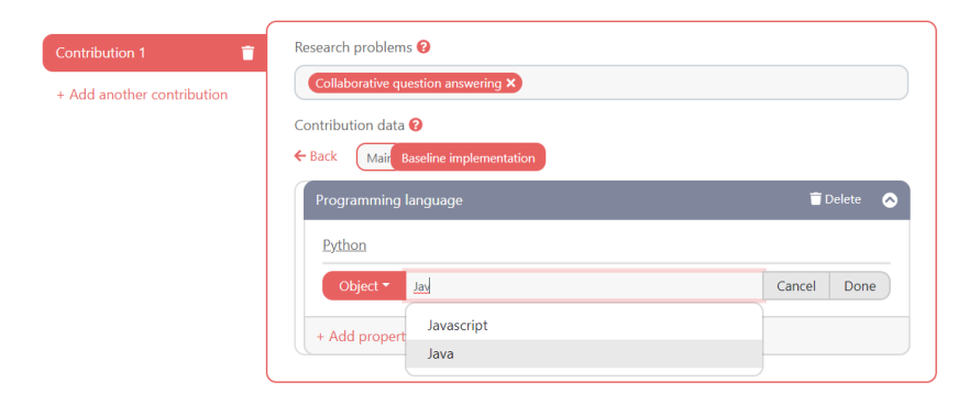
Fig. 2. ORKG UI curation wizard step (3) depicting the auto-completion feature that enables linking existing resources (here, Java).