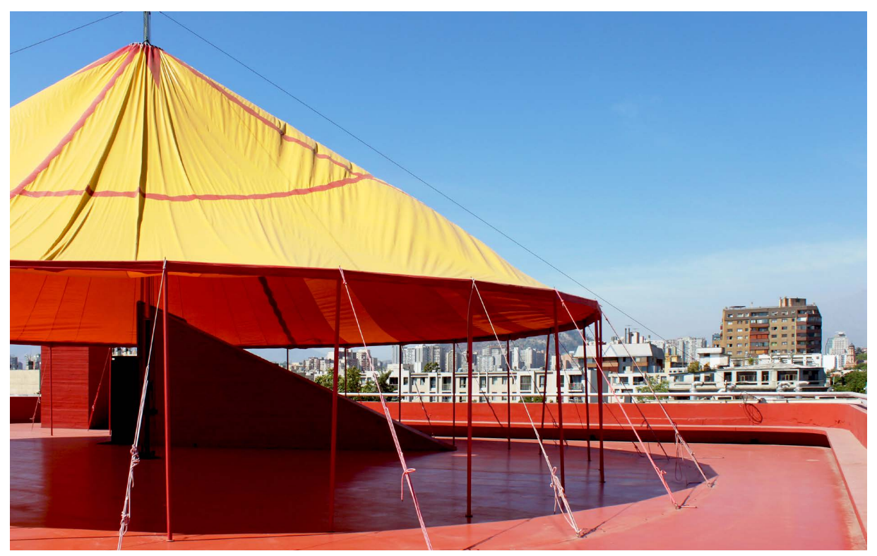
FIGURE 3 Smiljan Radić: NAVE, Santiago de Chile.