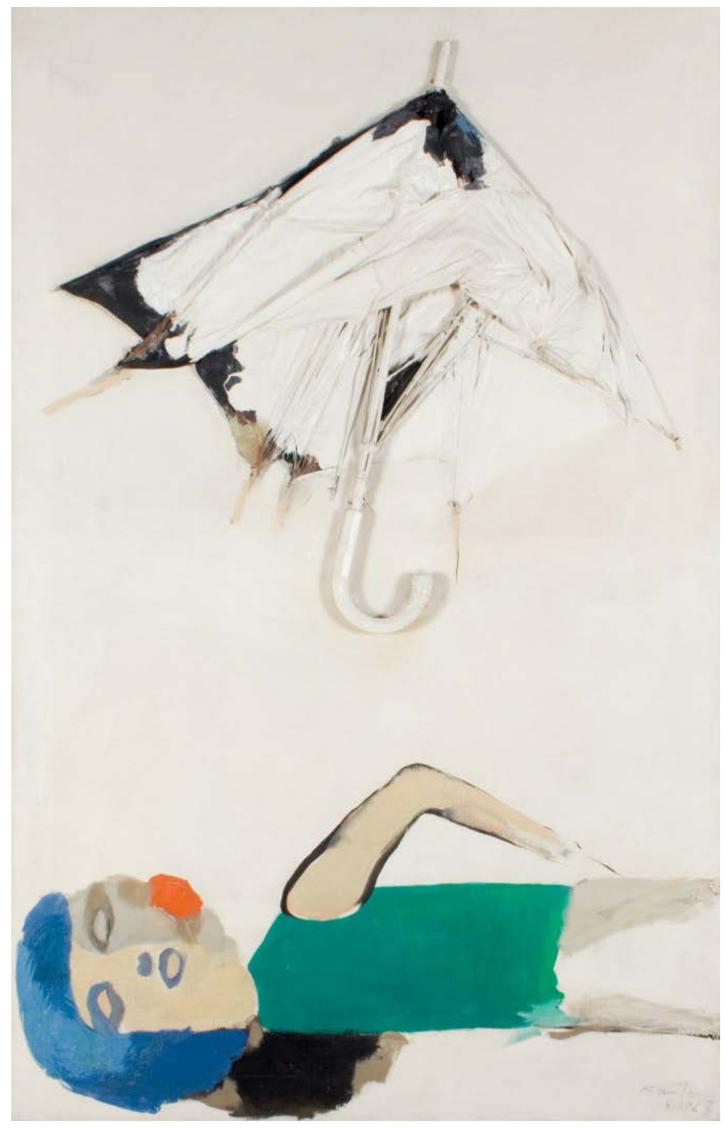
FIGURE 2 'Parasol i kobieta' by Tadeusz Kantor, 1967 Image credits T adeusz Kantor, 1967 (https://commons.wikimedia.org/wiki/File:Kantor_T_Parasol_i_kobieta.JPG), CC-BY-SA 3.0.