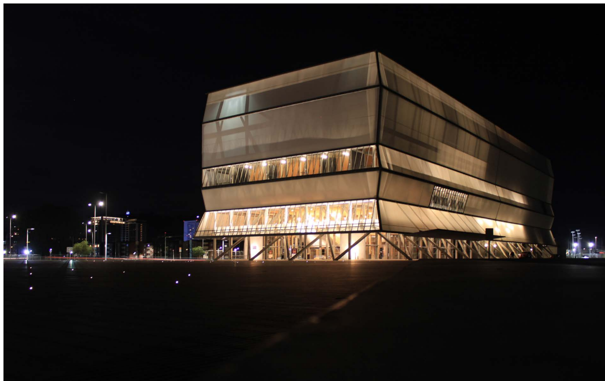
FIGURE 4 Smiljan Radić: Teatro Biobío, Concepción.