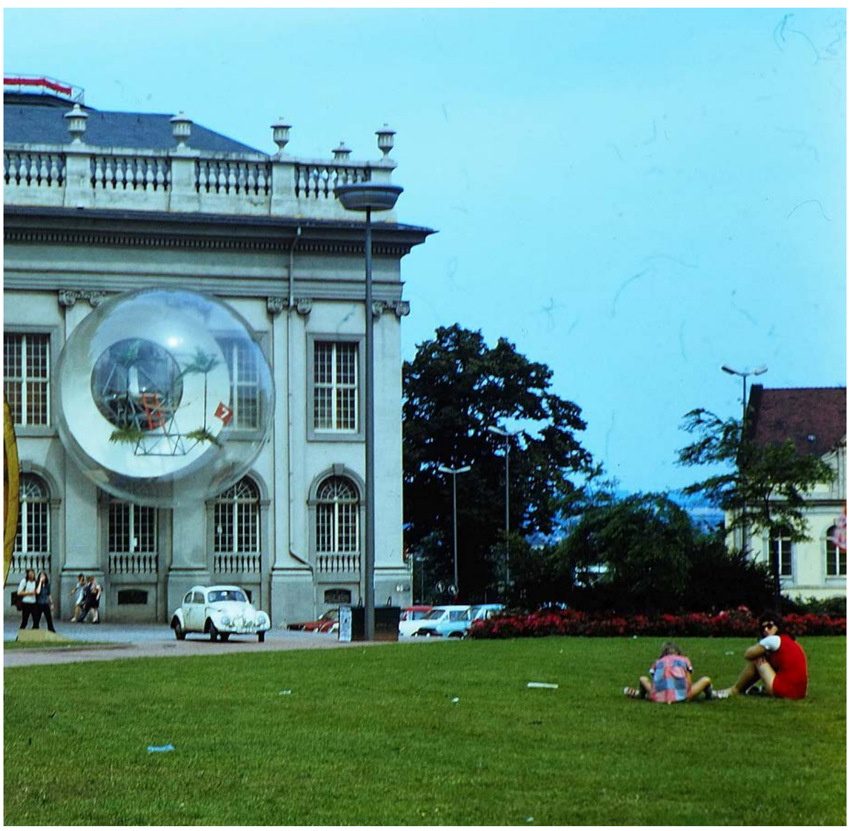
FIGURE 5 'Oasis No. 7' by the architecture and art group Haus-Rucker-Co. Image credits: © VG Bild-Kunst 2023, Photo: JeLuF (https://commons.wikimedia.org/wiki/File:Documenta_5,_Fridericianum.jpg), CC-BY-SA 4.0.

In OMA's hospital project, the research potential of architecture becomes evident, particularly in artistic works. People are accustomed to perceiving, reading, and interpreting architectural arrangements, often without consciously noticing or being able to describe them precisely. It is a tacit embodied knowledge acquired through bodily presence in architectural spaces. Architectural means are thus well-suited for expressing the consequences of changing conditions and abstract implications. In the context of climate change, there is considerable potential in architectural creations that speculatively depict life experiences, illustrating the intangible, long-term threats and their repercussions.