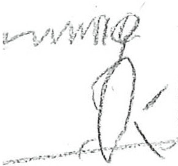
Fig. 2 Sound drawn and described by child X: And then you speak. That's me [draws a person]. So, and then [what you spoke] comes to the other like a lightning

The Schlieren setup seemed to have a significant influence on the way of experiencing sound in this interview setting. In order to better assess and evaluate this influence, it was important to investigate how the children perceived sound exclusively with the Schlieren setup. The outcome space for the ways of experiencing sound exclusively in the Schlieren setup is presented in Table 3.