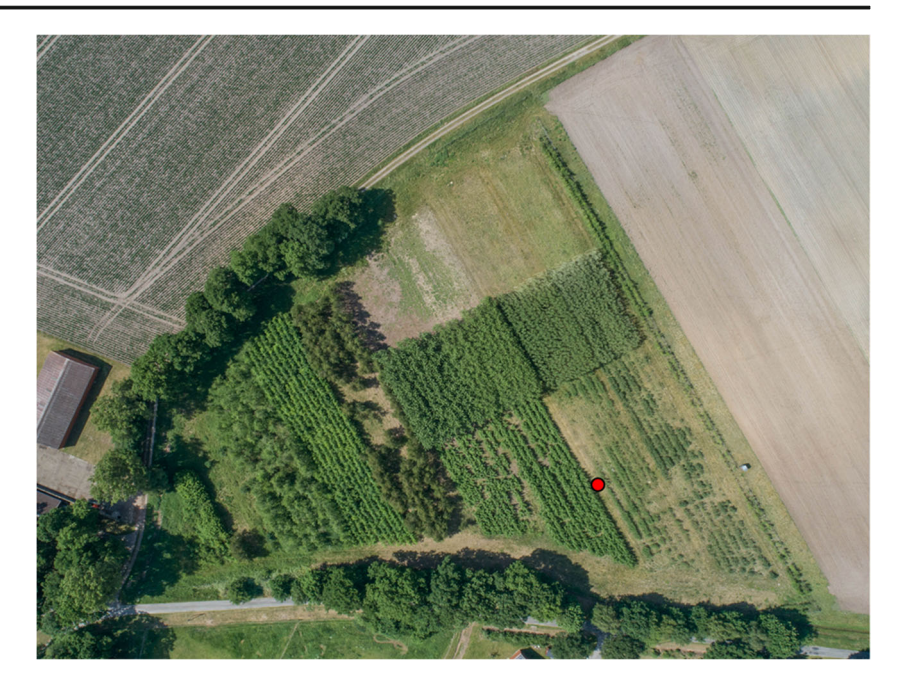
Fig. 2 Aerial view on one of the SRC study sites (site B). The species-specific cultivation units, each 20 m in width, with different poplar and willow hybrids (in different age classes) and different native woody species are clearly visible (Recording date: June 2019)

Only images with mammal species of at least the size of a red squirrel ( Sciurus vulgaris L., 1758) were taken into account. Images of smaller mammals (mostly Muroidea) were excluded from further consideration, as were images without any visible mammal species, images of birds and human-induced images. Since domestic mammals were not the objective of our study, detections of cats ( Felis silvestris catus L., 1758) and dogs ( Canis lupus familiaris L., 1758) were also excluded. For each detection, the date and time of the detection, the specific position of the CT on the particular study site and the mammal species shown on the particular series of images was documented (as long as this was determinable on basis of the photographic material).