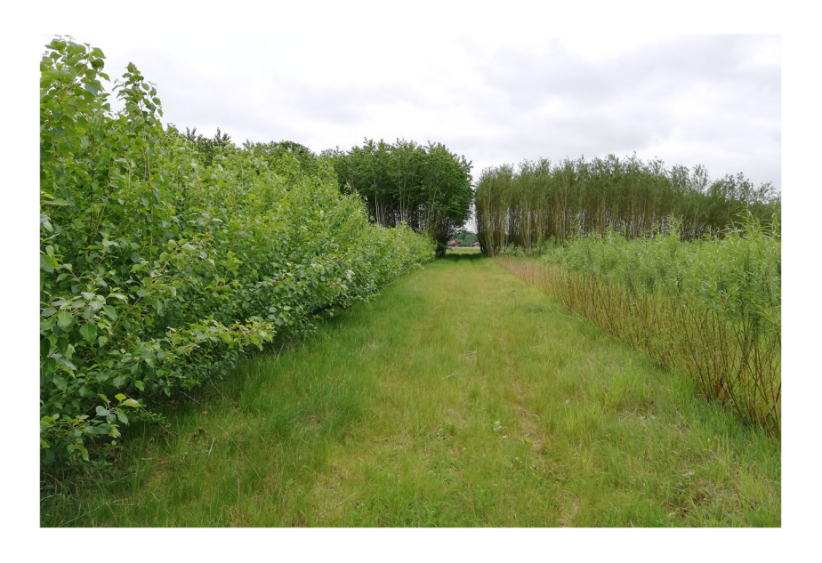
Fig. 3 Different age classes of poplar (left) and willow (right) hybrids on site B. The red dot in Fig. 2 indicates the point of view while taking the image (Recording date: May 2019)

• The Detection Rate (DR) indicates the number of detections per CT in relation to 100 camera nights (cf. Burton et al. 2015). We consider the DR as an indicator of the use intensity (cf. Armenteros et al. 2020). DR is given for the individual species and cumulatively for all species