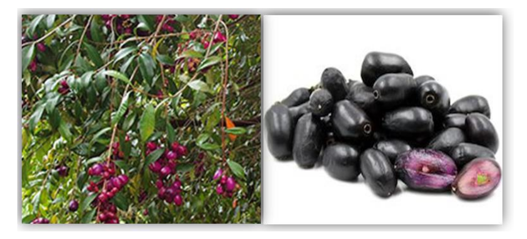
Figure 1. Leaves and fruits of Syzygium Cumini.

July) and lasts 30 to 40 days [1]. S. cumini fruits (1.5 to 3.5 cm) exhibit sweet flavor and mild astringency [2]. Bitterness can be reduced by pickling, adding some salt, and standing for a minimum of 1 h [3]. S. cumini fruits are eaten fresh, or as chutney, and jam. S. cumini juice is used for preparing summer drinks such as syrup, sherbet, and squash. The squeezed fruits are normally heated for 10 min and mixed with water, sugar, citric acid, and sodium benzoate for preservation [2].