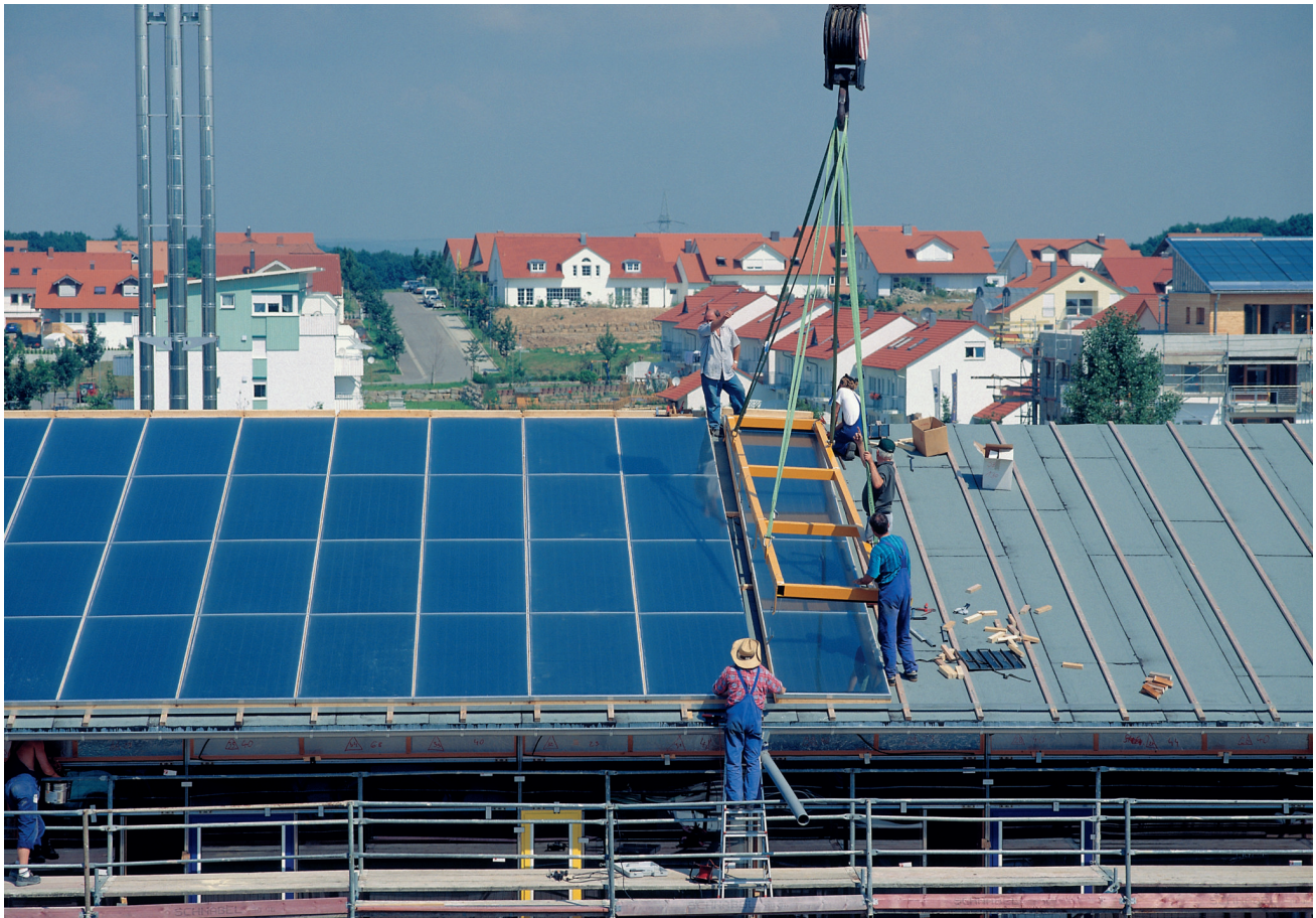
Figure 2: Construction workers installing PV systems

through installations) will remain in the region. It is now up to policymakers to drive forward the combination of supply and demand-side eco-innovation policies in such a way that regional lead markets emerge and both ecological and economic goals are met. In this respect, regional demand-side policies are lacking in sectors that Baden-Württemberg already promotes in its supply-side innovation policy, such as sustainable mobility, bioeconomy or circular economy.