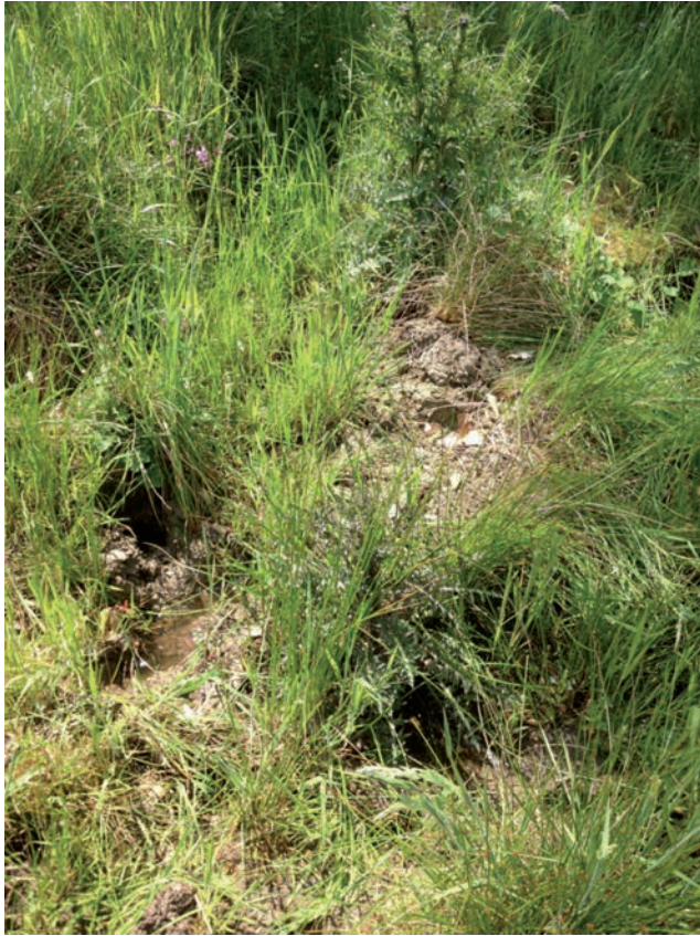
Figure 5. Spring water making a potentially suitable habitat for Galba truncatula .

and predictive values of the interactive map. In general the model is neither very sensitive nor very specific. When comparing the monthly findings of all surveys with the monthly risk models, 40.7% of the modelled risk areas habitats were found. Additionally, in the field survey of 2010, only 18.8% of the areas of risk class 0 were without potential habitats and snails were not found in any of them. The chance of finding a potential habitat in an area where a risk is predicted by the model was 51.4% for any month of the year. In contrast, the chance of absence of habitats in an area where no risk was predicted by the model was 13.0% for any month of the year. Considering the conditions of the previous months when calculating the risk, these results were improved. Nevertheless, the sensitivity, specificity, positive and negative predictive values remained low.