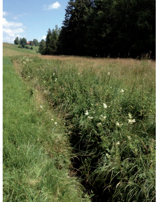
Figure 3. Drainage ditch in a swampy area making a potentially suitable habitat for Galba truncatula .