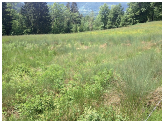
Figure 4. A swampy area making a potentially suitable habitat for Galba truncatula ; notice the rush as an indicator plant described by Rondelaud et al. (2011).