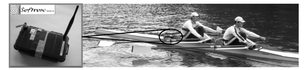
Figure 1. The training and measurement system Sofirow.

Figure 1 showed the feedback system Sofirow and its position located on top of the boat.