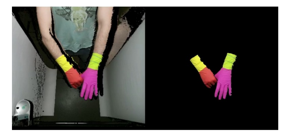
Figure 3. A subject is wearing colored gloves (left). The color frame is registered on the depth frame. Registration errors can be noted. The white reflectors on the sides help to achieve constant lighting conditions. Color thresholded hands, where each hand and underarm receive a label (right).