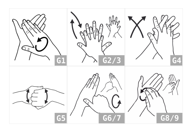
Figure 1. Six steps of the hand disinfection process. Some steps must be performed in variation to cover the areas of both hands.

The World Health Organization (WHO) suggests a hand disinfection process consisting of six steps, which are represented in Figure 1.<sup>1</sup> Each step consists of unique gestures which have to be applied in a rubbing movement. As some of the steps have to be performed in variation to cover the areas of both hands, the whole procedure can be classified into nine separate gestures. The recommended duration of the entire procedure is 20-30 seconds.