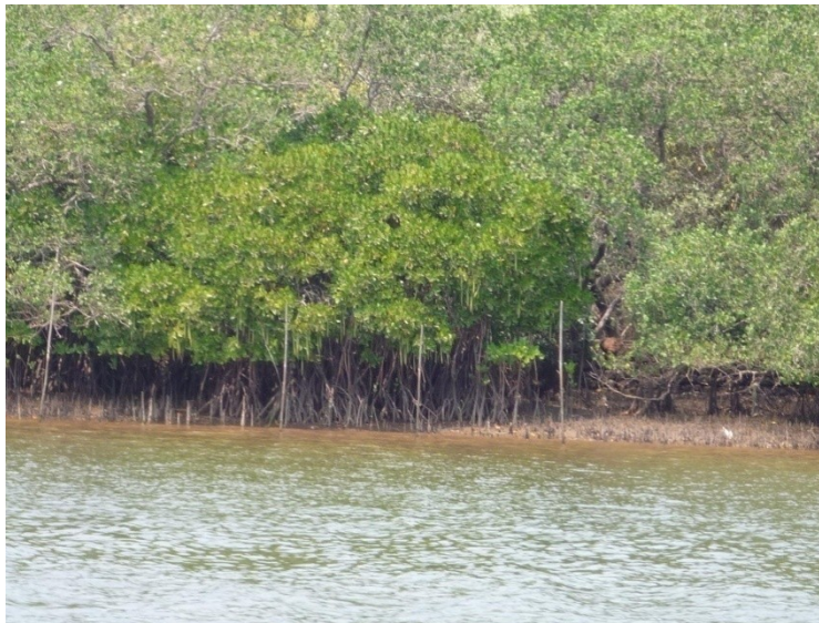
Figure 3. Mangrove forest in Tamil Nadu, India. Mangrove roots provide a tangled underwater habitat for many marine species.

Mangrove forests can attenuate wave energy, preventing the damage caused by tsunamis, as shown by various modeling and mathematical studies [74–79] which indicate that the magnitude of absorbed energy strongly depends on forest density, diameter of stems and roots, forest floor slope, bathymetry, the spectral characteristics (height, period, etc. ) of the incident waves, and the tidal stage at which the wave enters the forest. For instance, one model estimates that at high tide in a Rhizophora -dominated forest, there is a 50% decline in wave energy by 150 m into the forest [74]. Moreover, Mazda et al. [77] highlighted that the thickly grown mangrove leaves effectively dissipate high wave energy which occurs during storms such as typhoons and, therefore, protect coastal areas.