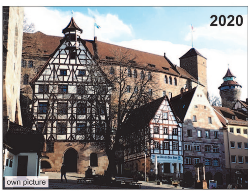
Figure 3. Half-timbered houses in old town of Nuremberg (own illustration with pictures from Stadtarchiv Nürnberg).

worker. This development is at least a dominant element in the structures of feeling. Half-timbering and the image of the traditional craftsman does not match with current feeling and is not given full attention. The beginning of the 20th century marks a turning point. In pointing out a contrast to industrialised modernity, half-timbered buildings gain attention.